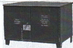
Food storage locker 3 ft x 4 ft x 3 ft

Rocky is renowned for its wildlife, and wildlife viewing is a favorite of many visitors. Help protect them by not attracting wildlife, including black bears, to your campsite due to improperly stored food. Bears can visit any time of day.